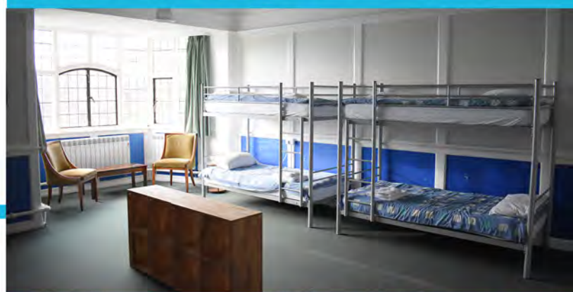
8 bed dormitory room with plenty of space and key coded locks. Bedding provided for groups.

The house has an automated fire alarm system and rooms are accessed via key coded locks.